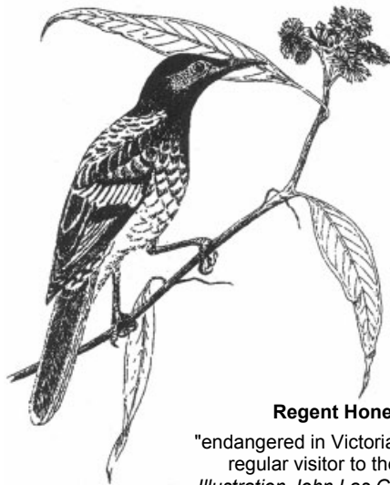
Regent Honeyeater "endangered in Victoria and a regular visitor to the area" Illustration John Las Gourges

This 21,565ha park is located between Beechworth and the low hills surrounding Chiltern and includes the striking Mt Pilot Range and Woolshed Falls. It protects a Box-Ironbark forest that contains a diverse range of natural and historic landscapes.