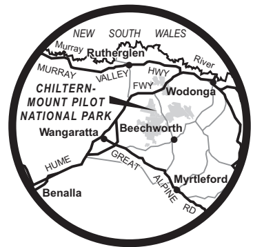
Map of Chiltern-Mount Pilot National Park and surrounding areas, including major roads, towns, and natural features.